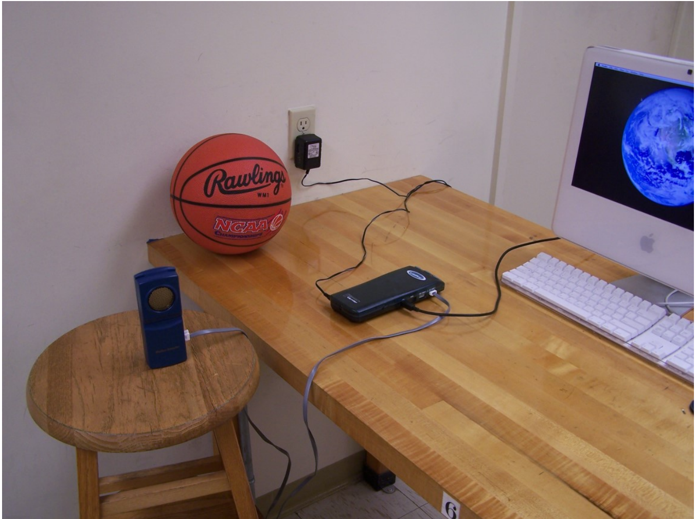
Figure 2.1: Experimental Setup