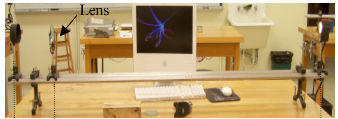
Figure 27-1 Conjugate Foci Method - 1 st measurement

A convenient method of measuring the focal length of a positive lens (forms a real image) is to use the conjugate foci method. If an object and the image are located a distance