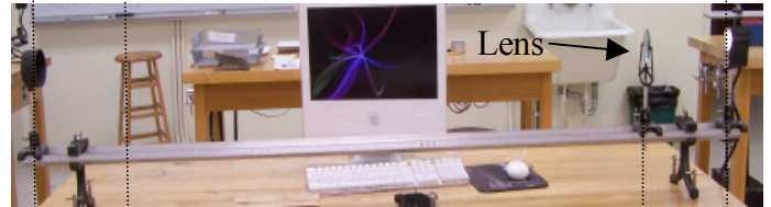
Figure 27-2 Conjugate Foci Method - 2 nd measurement