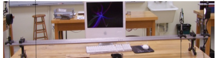
Figure 27-2 Conjugate Foci Method - 2 nd measurement