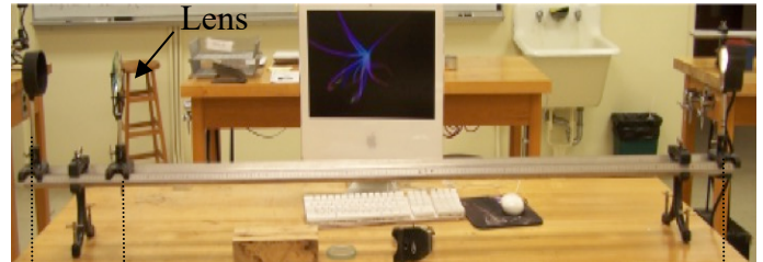
Figure 27-1 Conjugate Foci Method - 1 st measurement

A convenient method of measuring the focal length of a positive lens (forms a real image) is to use the conjugate foci method. If an object and the image are located a distance greater than 4f apart, then the following equation can be used: